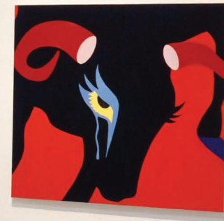
View from the exhibition Flies Roam the Skin Municipal Art Center, Gorzów Wielkopolski, 2023