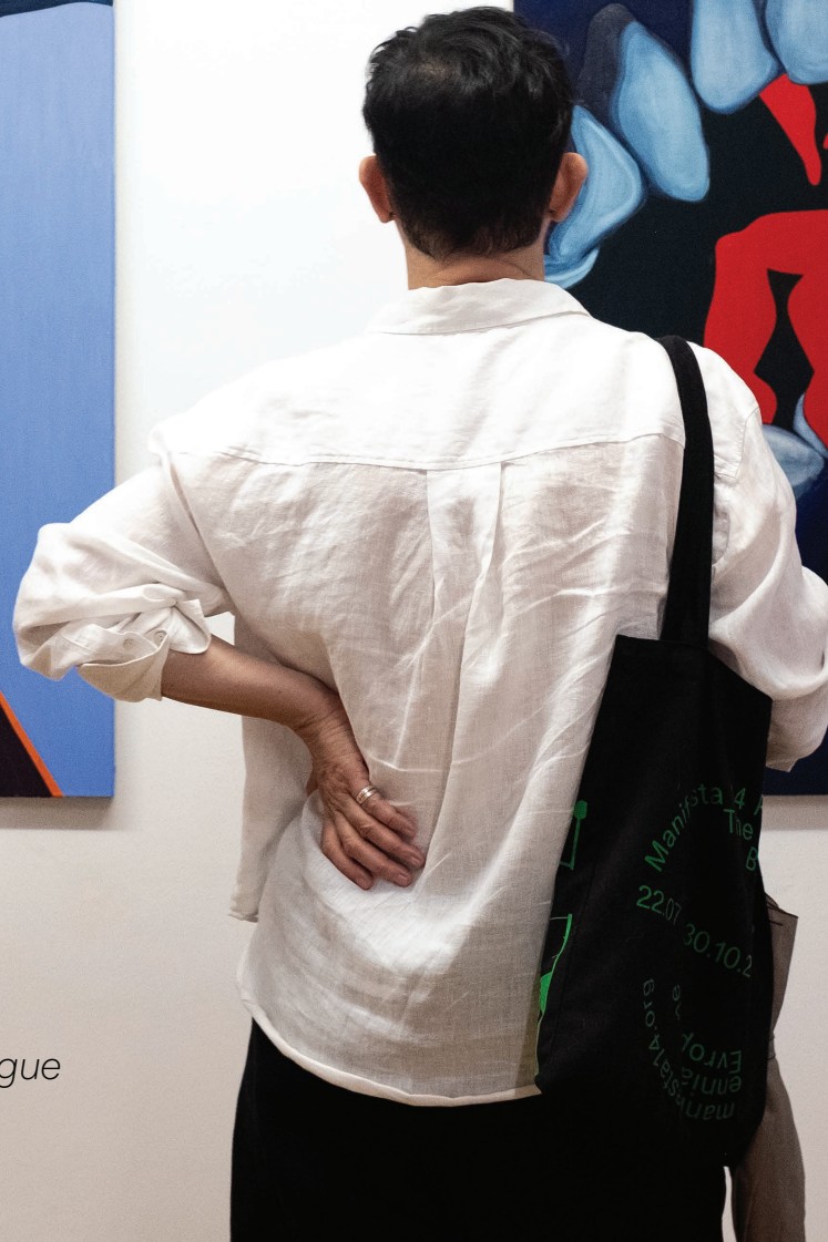
View from the exhibition Don't Stick Out Your Tongue Turnus Gallery, Warsaw, 2024